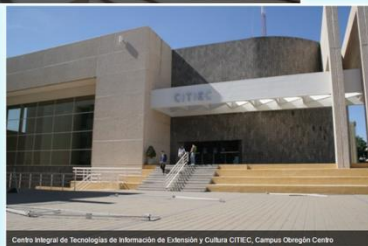
Centro Integral de Tecnologías de Información de Extensión y Cultura CITEC, Campus Obregón Centro