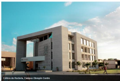
Edificio de Rectoría, Campus Obregón Centro